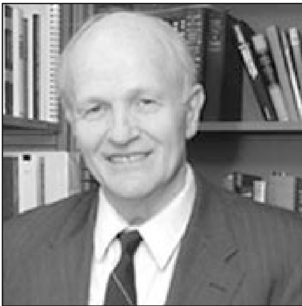
FAS member photo