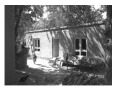
New house in Nahri

Searching for technology concepts in home construction is not an easy task. The industry remains astoundingly isolated from the management and technical innova-