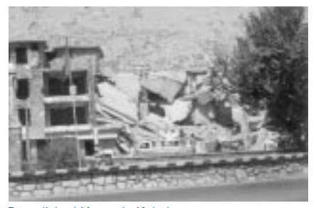
Demolished House in Kabul

Traditional construction has also become more difficult because of the scarcity of wood. Many of the NGOs are forced to import wood from Pakistan and other nations since decades of nonexistent forest management have devastated Afghanistan's local timber supplies. Those not able to import wood are