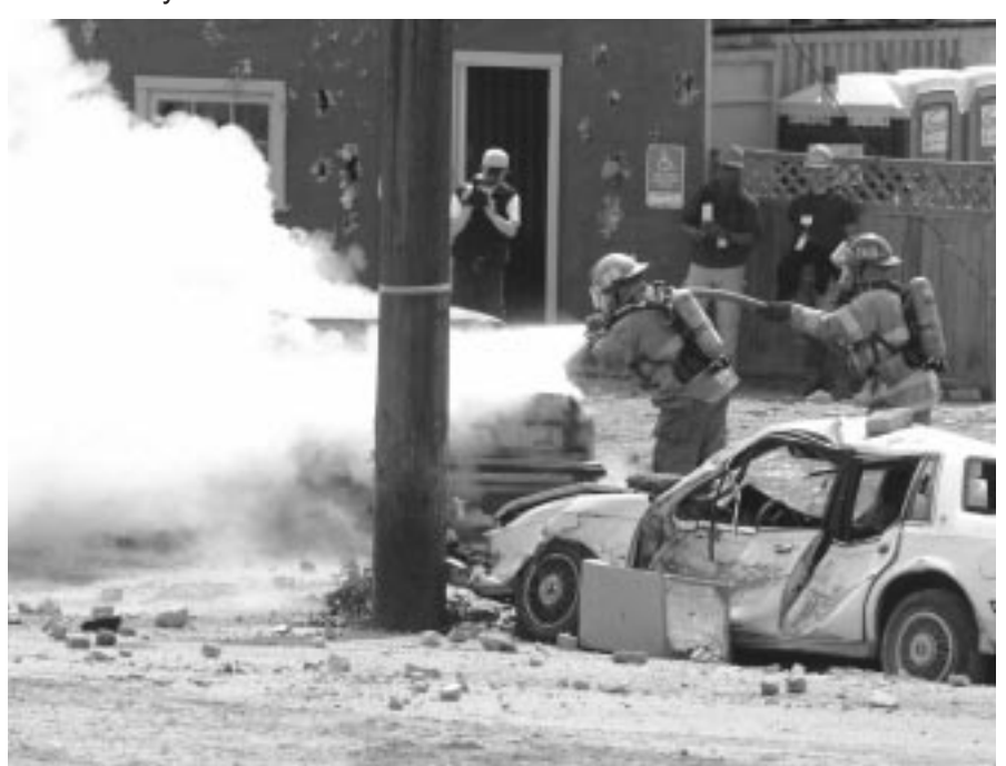
Main site of simulated dirty bomb detonation.