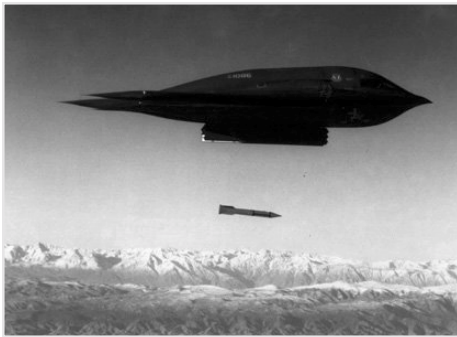
Figure 3. A B2 bomber releases an unarmed B61-11 earth-penetrating bomb during tests in Alaska. Despite falling from an altitude of 40,000 feet, this bomb burrowed only approximately 20 feet into the soil. Any nuclear blast at this shallow depth would not be contained, and would produce intense local fallout.