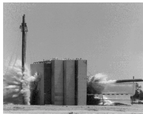
Figure 2. The Pentagon has a growing collection of high precision conventional weapons capable of defeating hardened targets. In this sled-driven test, the GBU-28 laser guided bomb with its improved BLU-113 warhead penetrates several meters of reinforced concrete.

Moreover, as Congress understood in 1994, by seeking to produce usable