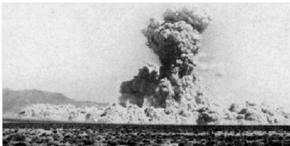
Figure 4. The 100 KT Sedan nuclear explosion, one of the Plowshares excavation tests, was buried at a depth of 635 feet. The main cloud and base surge are typical of shallow-buried nuclear explosions. The cloud is highly contaminated with radioactive dust particles and produces an intense local fallout.

In addition to the immediate effects of blast, air shock, and thermal radiation, shallow nuclear explosions produce especially intense local